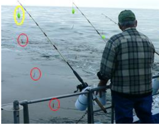
Photo of longleader gear ready to be deployed