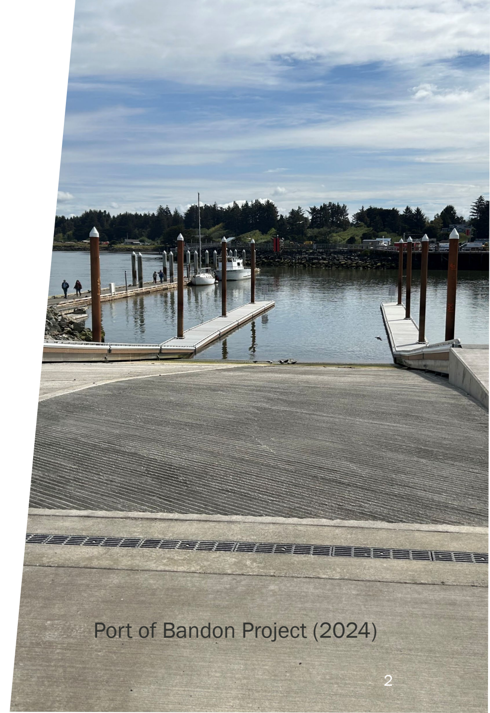
Port of Bandon Project (2024)