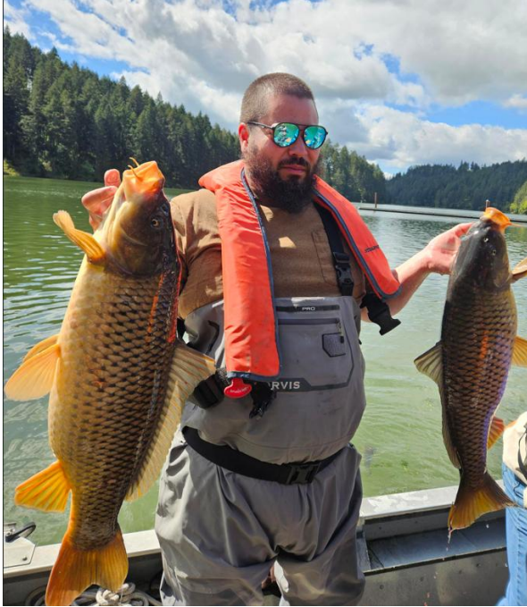
Umpqua Fish District staff discovered common carp in Cooper Creek Reservoir in April.

evan.leonetti@odfw.oregon.gov or call 541-440-3353. Anglers should not put live carp back in the water. Because carp are non-game fish in Oregon, there is no harvest limit, and it is legal to dispose of the fish.