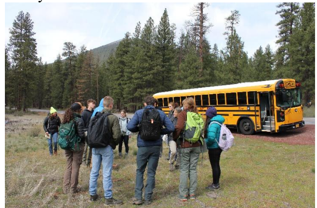
B2S bioblitz students arrive for field work.

Between April 14 and April 27, ODFW, OSU-Cascades and Sisters High School worked closely together to conduct a bioblitz at four proposed wildlife crossing locations along Highway 20. These locations are part of the Bend to Suttle Lake Wildlife Passage Initiative, fondly referred to as “B2S.”