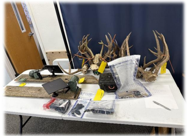
Fish and Wildlife Division members execute search warrant with assistance from OSP SWAT.

following charges: Felon in Possession of a Weapon, Criminal Trespass with a Firearm, No Annual Hunting License, No Big Game Tag, Unlawful Possession of Machine Gun, Unlawful Possession of Firearm Silencers (X6), Supplying Contraband, and Unlawful Possession of Schedule II Substance. The second suspect was lodged at the Lane County Jail on the following Charges: Violation of Stalking Order, Unlawful Possession of a Firearm, No Annual Hunting License, No Big Game Tag, Unlawful Possession of Buck Deer (X9), Unlawful Possession of Bobcat, and Unlawful Possession of Grouse.