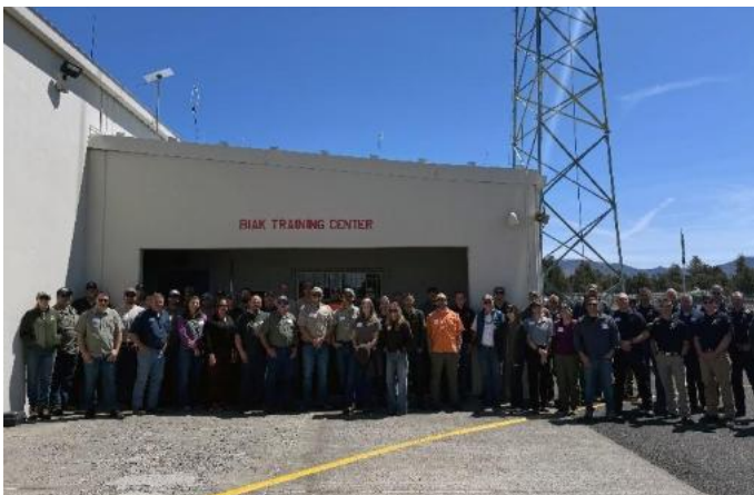
Attendees of the May 2026 OR WHART in Redmond.

Around 30 students representing ODFW, OSP, U.S. Fish and Wildlife Service and U.S. Department of Agriculture Wildlife Services attended this year's training. Feedback from student evaluations showed that the training was a highly positive experience and provided impactful hands-on training, increasing staff preparedness to respond to wildlife-humans attacks.