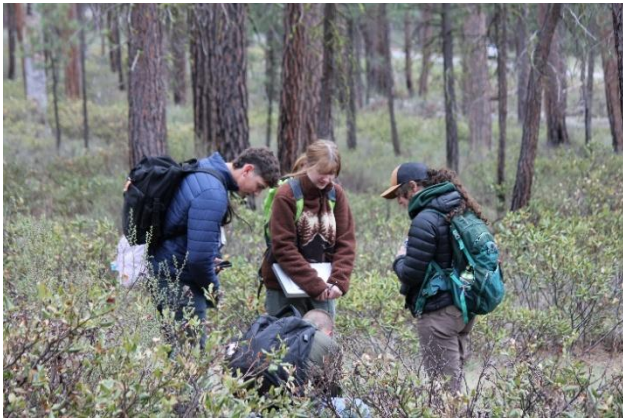
Students conduct wildlife surveys during the B2S bioblitz.

ODFW and OSU started the program in the classroom by teaching students about the importance of habitat connectivity for biodiversity and the role that wildlife crossings can play in offsetting the impacts of road networks on wildlife. Then the 16 participating junior high school students conducted surveys of birds, mammals, amphibians and reptiles, insects, plants and fungi at each side of the highway at the four proposed crossing locations.