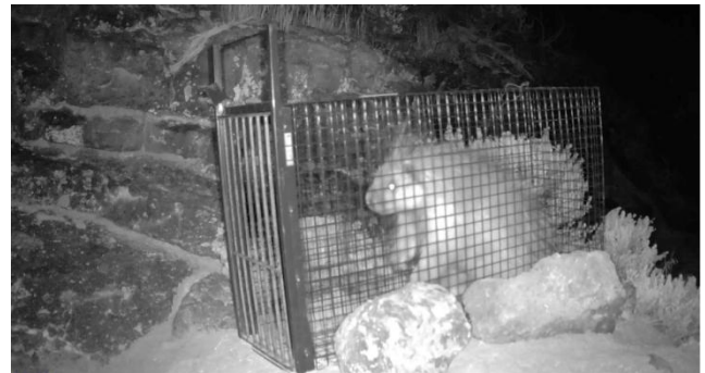
Porcupine in a box trap captured by Deschutes district staff.

Capture efforts will continue through the summer as staff work to deploy the remaining 13 GPS collars.