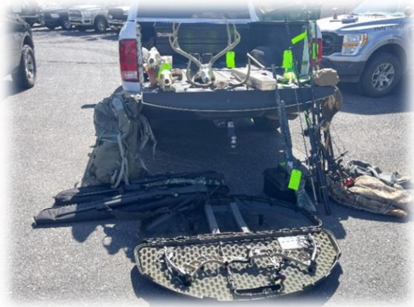
Fish and Wildlife Division members execute multiple search warrants related to poaching investigation.

Fish and Wildlife Division members executed a search warrant on a residence in East Multnomah County related to several wildlife crimes. During that search warrant drugs, guns, and evidence of wildlife crimes were seized, along with two of the suspect's cellphones. Additional information from cellphone data revealed several other wildlife crimes. These crimes involved the poaching of salmon/steelhead, unlawful sale of recreationally caught spring salmon, baiting and killing bears, additional deer poached with archery equipment at night, and an elk that was killed unlawfully. As a result, three additional search warrants were executed at residences in Multnomah and Klamath Counties. During the search an additional bear that had been killed over bait was discovered. Several pieces of evidence were seized including salmon angling gear, guns, archery equipment, 3 bear skulls, 2 deer skulls, elk meat, and additional hunting gear.