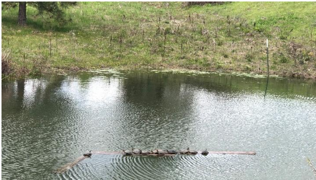
Northwestern pond turtles basking in a small pond on private property in Mosier area.

Annual monitoring efforts have historically included 6 to 10 trapping sessions at each pond site to estimate population size and survival. NWPTs are uniquely marked with PIT tags. Each individual is measured once per season to determine growth rates. These repeated captures allow staff to estimate population size, survival rates, turtle movements, and the number of young turtles being born.