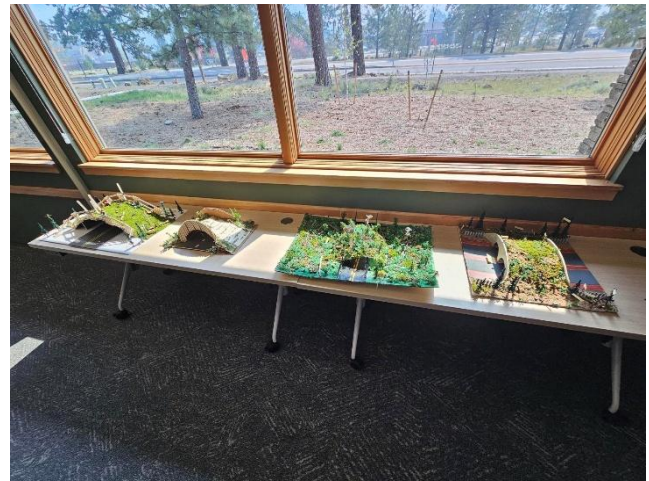
Dioramas created by Sisters High School students.

They learned how to use apps like iNaturalist, Merlin, eBird and Avenza to conduct surveys along with a wildlife professional. Students then broke into four groups to summarize biodiversity information, design and construct a diorama representing a crossing structure for each of the proposed locations. They presented survey results and dioramas to the USFS Sisters Ranger District, classmates and members of the B2S coalition.