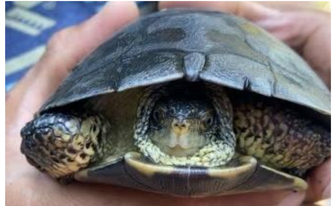
Northwestern pond turtle poses for a photo during annual study.

In 2023 and 2024, staff deployed a remote PIT array at one of the most productive pond sites with the help of fish research staff. This array allowed staff to monitor the times at which turtles exited and re-entered the pond. The PIT tag array provided new insight into turtle behavior, particularly when turtles leave ponds possibly to nest. Most turtle movements occurred from late spring through mid-summer. Female turtles were especially active in the mornings and evenings, consistent with typical nesting behavior.